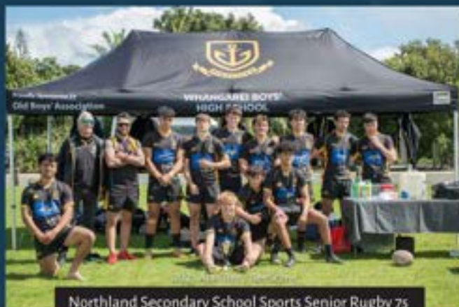
Northland Secondary School Sports Senior Rugby 7s sheltering from the elements under the Gazebo, proudly sponsored by WBHS OBA

If you wish to discuss any matter at all regarding a donation or bequest please feel free to email the OBA President at: president@wbhsoba.co.nz