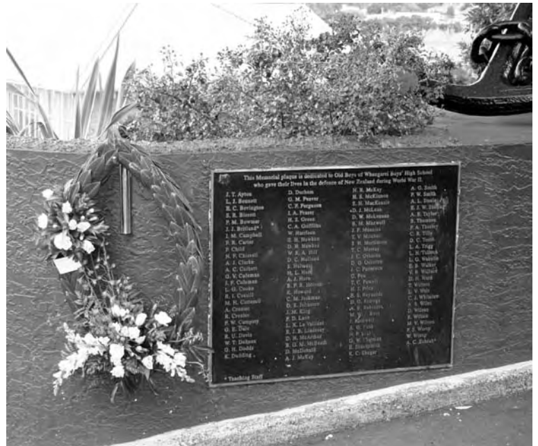
The service concluded as normal with the laying of a wreath at the memorial anchor.