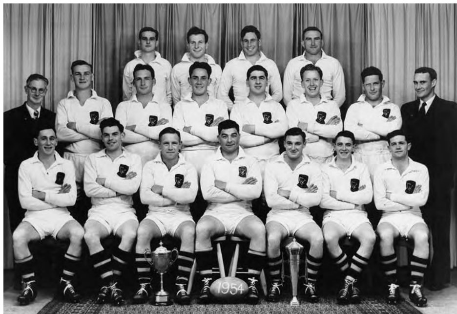
Old Boys' Senior Team 1954. Winners of the Senior Championship and Frank Collins Cup

This is a wonderful gesture for Whangarei Boys' High School Old Boys and one we hope many will take advantage of so that we can maintain a relationship that has existed for over 85 years.